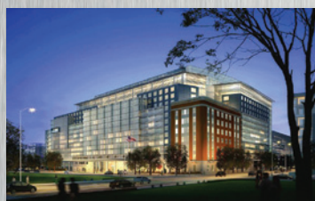
Washington Marriott Marquis Hotel at the Washington Convention Center — currently under construction